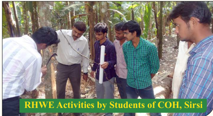
RHWE Activities by Students of COH, Sirsi