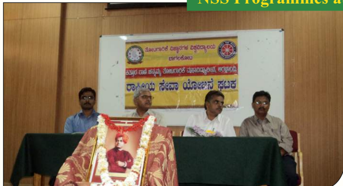
151 st Birth Anniversary of Swamy Vivekanand By NSS Unit of KRCCH, Arabhavi