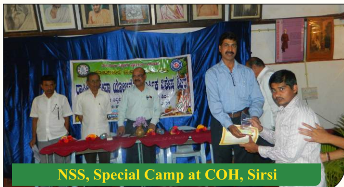
NSS, Special Camp at COH, Sirsi