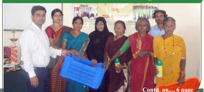
Contd. on.... 6 page