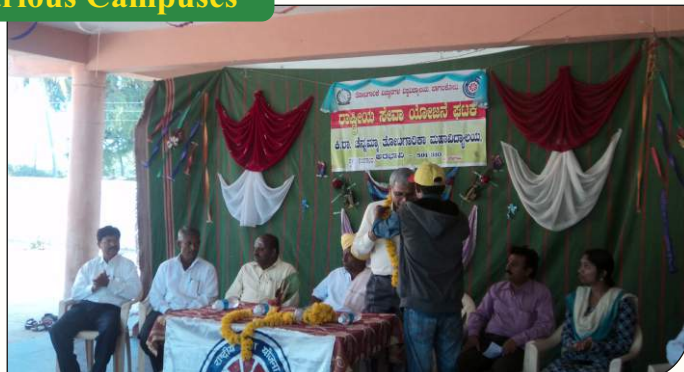
Annual NSS Programme from 5.01.2014 to 11.01.2014 at Nandagaon Village by KRCCH, Arabhavi